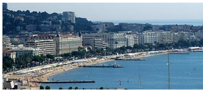
Cannes: Hotels along La Croisette and the beach

<u>Day 3 – Thursday, October 12</u>: After breakfast, exploration of <u>Grasse</u>, with a guided tour of one of the numerous local perfume manufacturies. On to <u>Cannes</u> for a sightseeing tour, by little tourist train, of the old town and the waterfront boulevard, La Croisette, backdrop of the city's annual movie festival. After lunch we head for nearby Antibes, founded by the ancient Greeks, where we view the monument commemorating Napoleon's return from exile on the island of Elba and visit the local museum focused on the work of Picasso, who lived for many years in this area; the <u>Picasso Museum</u> occupies the site of the Greek acropolis, which became a Roman and then a medieval fortress belonging to the Grimaldis, a famous Genoese family whose descendants still rule Monaco. Return to our hotel in late afternoon and free evening.