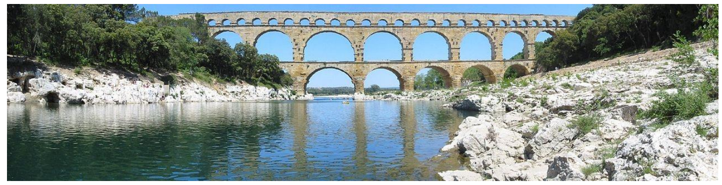
The amazing Pont du Gard

<u>Day 12 - Saturday, October 21</u>: After breakfast we drive a short distance to visit the <u>Pont du Gard</u>, an amazing Roman acqueduct, a UNESCO World Heritage Site, situated in the middle of a wonderful Provençal landscape. On to the beautiful city of Nimes, where a tour by little tourist train will enable us to admire some very well-preserved Roman monuments, including a temple known as the Maison Carrée, as well as an amphitheatre (or arena) where bullfights are now occasionally performed. Continue to <u>Arles</u>, located on the banks of the Rhone River, an ancient and charming Provençal town featured in many paintings by Van Gogh, who lived here for some time. Our local walking tour there will include all the monuments that earned this town the title of UNESCO World Heritage Site: the Roman amphitheatre; the fine Romanesque Saint-Trophime Church; and the quaint Place du Forum, where the café featured in Van Gogh's 'Café Terrace at Night' is just perfect for a coffee break! On the way back to our hotel, we visit Le <u>Mas des Tourelles</u>, a winery where we will learn how wine was made by the Romans and taste wine still made the same way!