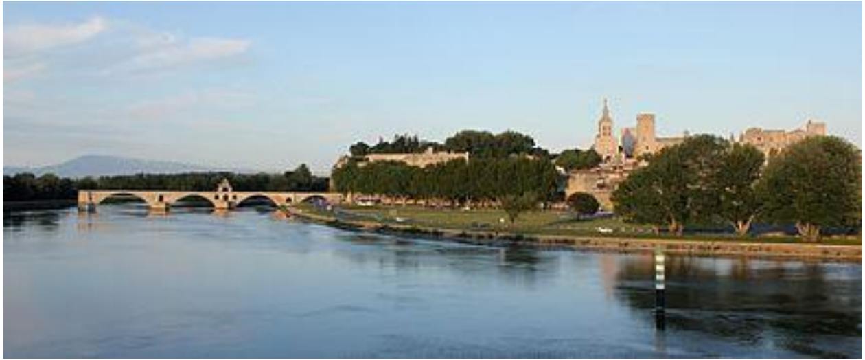
Panoramic view of Avignon and its famous bridge

<u>Day 15 – Tuesday, October 24</u>: After breakfast, transfer to Marseille Airport in time for the return flight to Toronto.