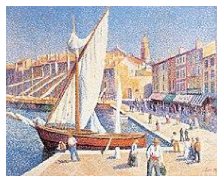
The port of Saint-Tropez, by Maximilien Luce (1893)