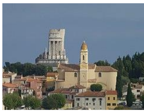
The Trophy of the Alps at La Turbie

<u>Day 4 – Friday, October 13</u>: Full-day excursion along the French Riviera, a.k.a. the Côte d'Azur. The most beautiful and interesting stretch, between Nice, the "queen city" of this playground, to the Italian border, involves three spectacular scenic routes known as <u>Corniches</u>. We start out along the Lower Corniche, a stunning drive along the coast all the way to Menton, the last town before the border. En route we will pay a visit to the Principality of Monaco, with the old town and the Prince's Palace as well as the Monte Carlo district with its famous Casino. Return via a stretch of the Grande Corniche, the high mountain road. In the village of La Turbie, an impressive monument, known as the "Trophy of the Alps," was erected by the Romans to celebrate their conquest of this southern part of Gaul, as France was known then, turning it into a province of their empire, hence the name Provence. It was here that a major Roman road entered Gaul, an extension of the famous Via Aurelia, but known locally as the <u>Via Julia Augusta</u>. Descending to the level of the Middle Corniche, we enjoy spectacular views of the Mediterranean coast as we head for Nice for a panoramic tour of this magnificent city, including its old town as well as the world-famous waterfront boulevard, the Promenade des Anglais. Return to our hotel in the early evening.